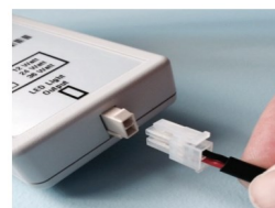
Light Fitting Output

Note: Each driver has an additional set of input terminals to allow drivers to be chained together.