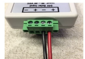
Solar Panel Input